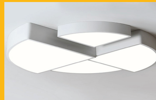
Custom Shaped Lighting Fixtures

VERSATILE IN SHAPE TO ACCOMMODATE ANY AVAILABLE SPACE