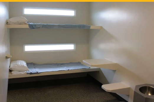
Correctional & Treatment Facilities

This solution provides increased security over existing lighting products. AREAS OF INTEREST: